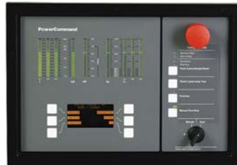
Optional features shown