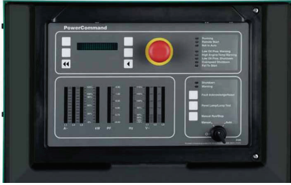
Optional Features Shown