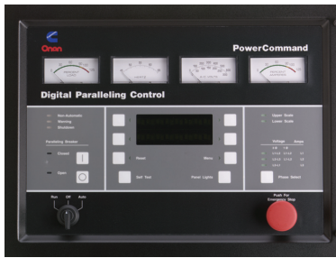
Optional Features Shown